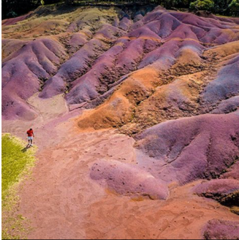
Chamarel Seven Coloured Earth Geopark

The Chamarel Seven Coloured Earth Geopark in Mauritius features unique sand dunes of seven colors formed over 600 million years by volcanic activity. Spanning 8.5 hectares, the Geopark combines geology, education, and conservation, offering stunning views, waterfalls, and a tortoise park with giant Aldabra tortoises. It is a key attraction, connecting visitors with nature and the island's geological history.