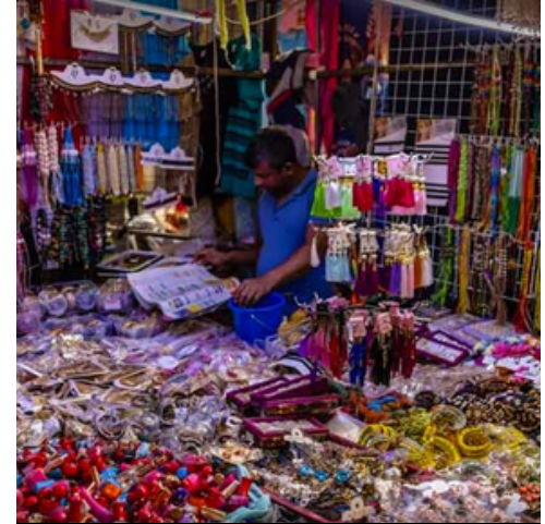
Quatre Bornes Market

Bagatelle Mall in Moka, Mauritius, is the island's top shopping and leisure destination, featuring over 155 shops with international and local brands. It includes a diverse food court, a large hypermarket, a six-screen cinema, and family-friendly entertainment options. The mall's modern design combines Mauritian charm with convenience, making it a popular spot for locals and tourists seeking a comprehensive shopping experience.