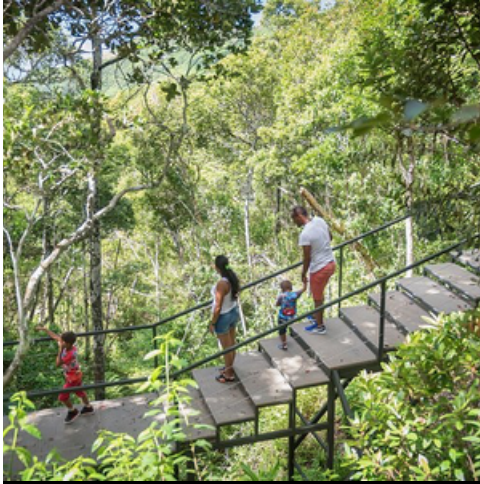
Ebony Forest Reserve Chamarel

Ebony Forest Reserve Chamarel is a 45-hectare conservation area in Mauritius focused on preserving endangered native flora and fauna. It features ancient ebony trees, guided walks, safari jeep rides, hiking trails with beautiful views, and an educational museum. The reserve is also home to rare endemic birds, making it ideal for nature lovers and birdwatchers.