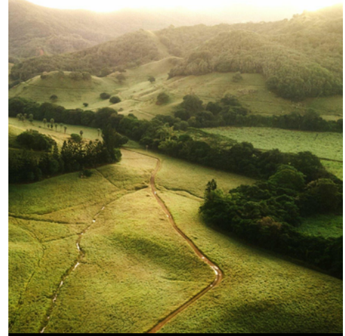
La Vallée de Ferney

Bois Cheri Tea Factory is Mauritius' oldest and largest tea plantation, established in 1892. Located on scenic rolling hills, it offers guided tours through lush tea fields and the factory, where visitors learn traditional tea production methods. The visit includes a tea museum and tasting sessions featuring a variety of local teas. The estate also has a restaurant with panoramic views, making it a must-visit for tea lovers.