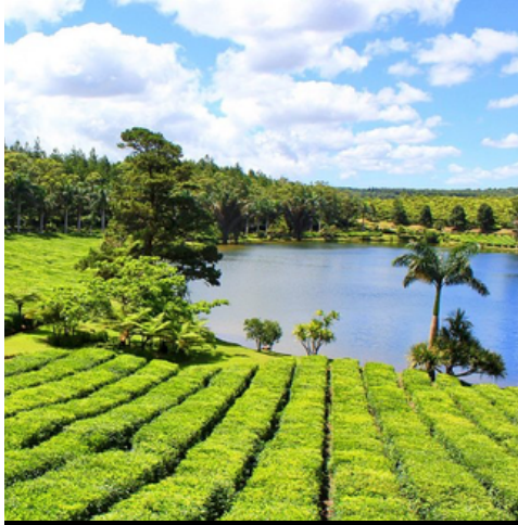
Bois Cheri Tea Factory

Ebony Forest Reserve Chamarel is a 45-hectare conservation area in Mauritius focused on preserving endangered native flora and fauna. It features ancient ebony trees, guided walks, safari jeep rides, hiking trails with beautiful views, and an educational museum. The reserve is also home to rare endemic birds, making it ideal for nature lovers and birdwatchers.