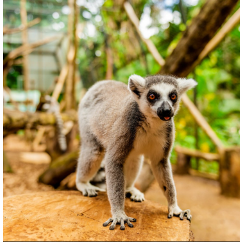
La Vanille Nature Park

The Chamarel Seven Coloured Earth Geopark in Mauritius features unique sand dunes of seven colors formed over 600 million years by volcanic activity. Spanning 8.5 hectares, the Geopark combines geology, education, and conservation, offering stunning views, waterfalls, and a tortoise park with giant Aldabra tortoises. It is a key attraction, connecting visitors with nature and the island's geological history.